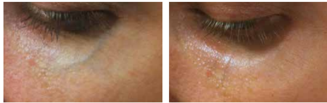
Vascular Lesion / Reticular Vessel 1 Tx (Nd:YAG 1064)