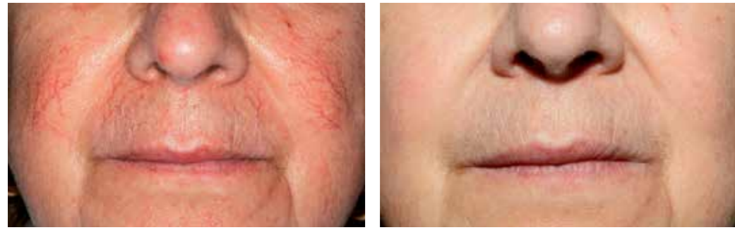
Telangiectasias 3 Tx (2 VL 555 + 1 PR 530)