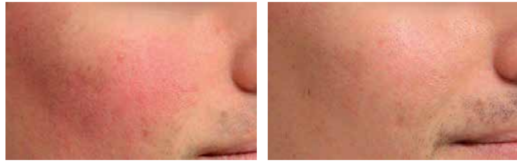
Rosacea 3 Tx (PR 530 with short pulses)