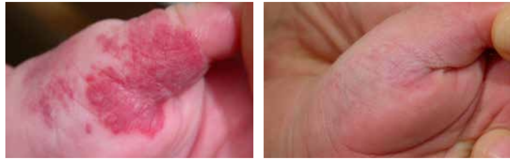
Hemangioma 3 Tx (1 PR 530 + 2 VL 555)