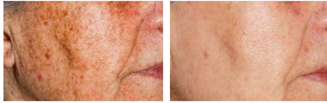
Photorejuvenation 3 Tx (2 VL 555 + 1 PR 530)