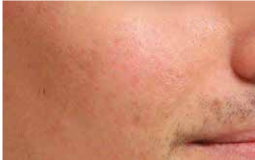
Rosacea 3 Tx (PR 530 with short pulses)