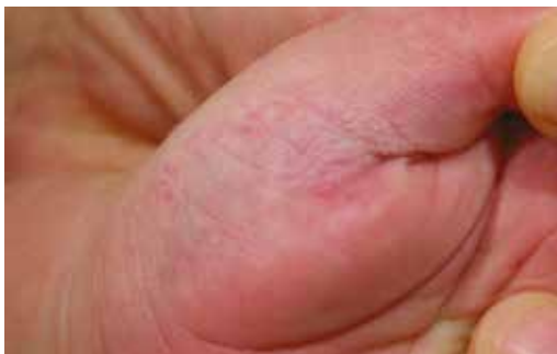
Hemangioma 3 Tx (1 PR 530 + 2 VL 555) Courtesy of Prof. Drosner