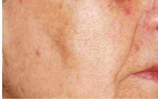
Photorejuvenation 3 Tx (2 VL 555 + 1 PR 530)