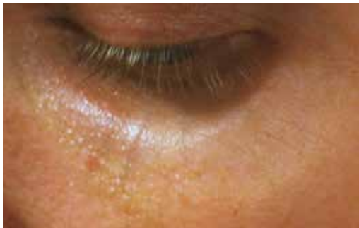
Vascular Lesion / Reticular Vessel 1 Tx (Nd:YAG 1064)