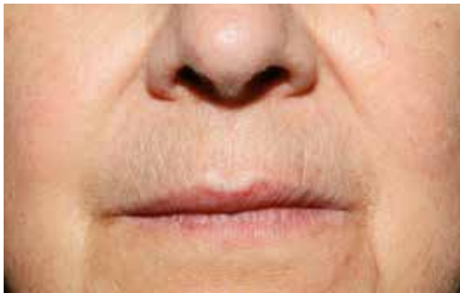
Telangiectasias 3 Tx (2 VL 555 + 1 PR 530)